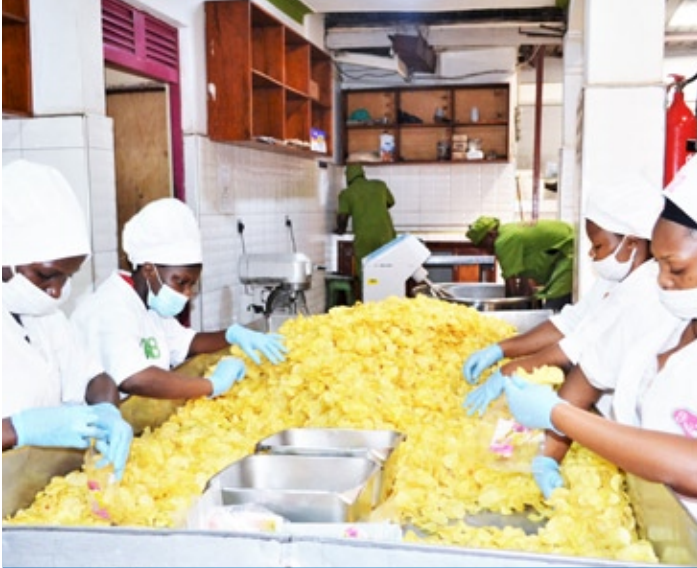
BEFORE: Potato crisps were packaged by hand prior to Psalms' investment in new machinery.