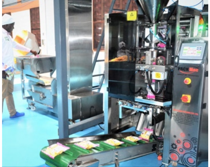
AFTER: The new equipment has increased production speed and can package 120 units every 5 minutes.