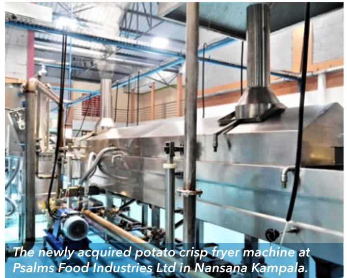
The newly acquired potato crisp fryer machine at Psalms Food Industries Ltd in Nansana Kampala.

The REACH-Uganda project, under the funding of the Embassy of the Kingdom of the Netherlands in Uganda, embarked on tactical support to improve the branding and packaging of the potato crisps with the aim of increasing shelf life, visibility, and sales of PFIL crisps on the market.