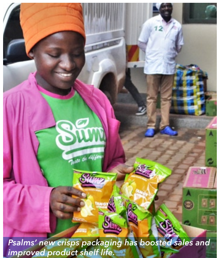
Psalms' new crisps packaging has boosted sales and improved product shelf life.