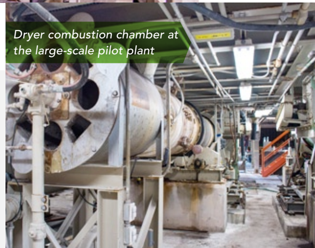
Dryer combustion chamber at the large-scale pilot plant