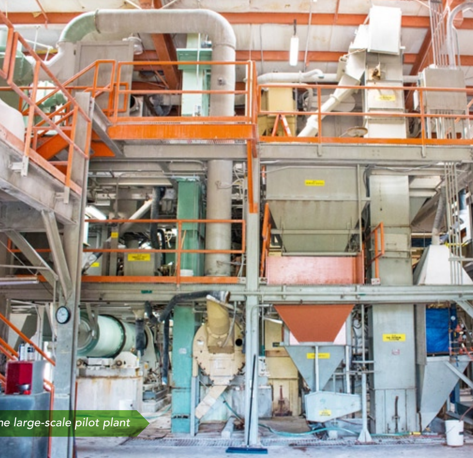
The large-scale pilot plant