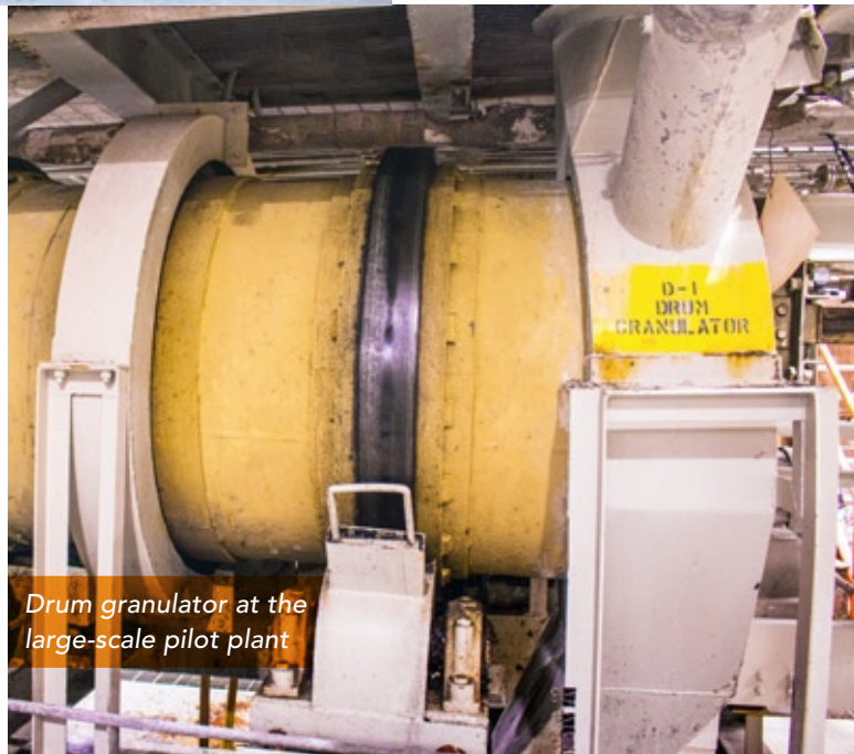
Drum granulator at the large-scale pilot plant

All process and product development are conducted under confidentiality agreements and all technology that is developed goes to the ownership of our client.