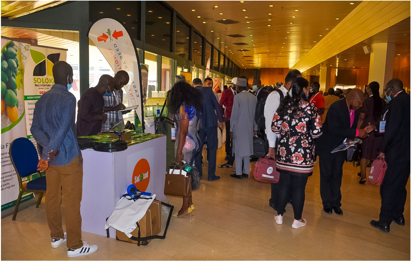
Program Launch participants visiting various boots at the HortiNigeria Program Launch.