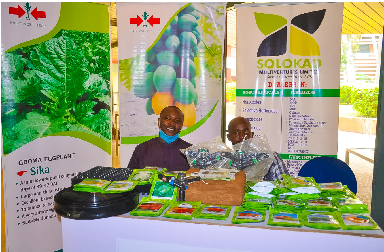
Solokad Exhibition booth at the HortiNigeria Program Launch.